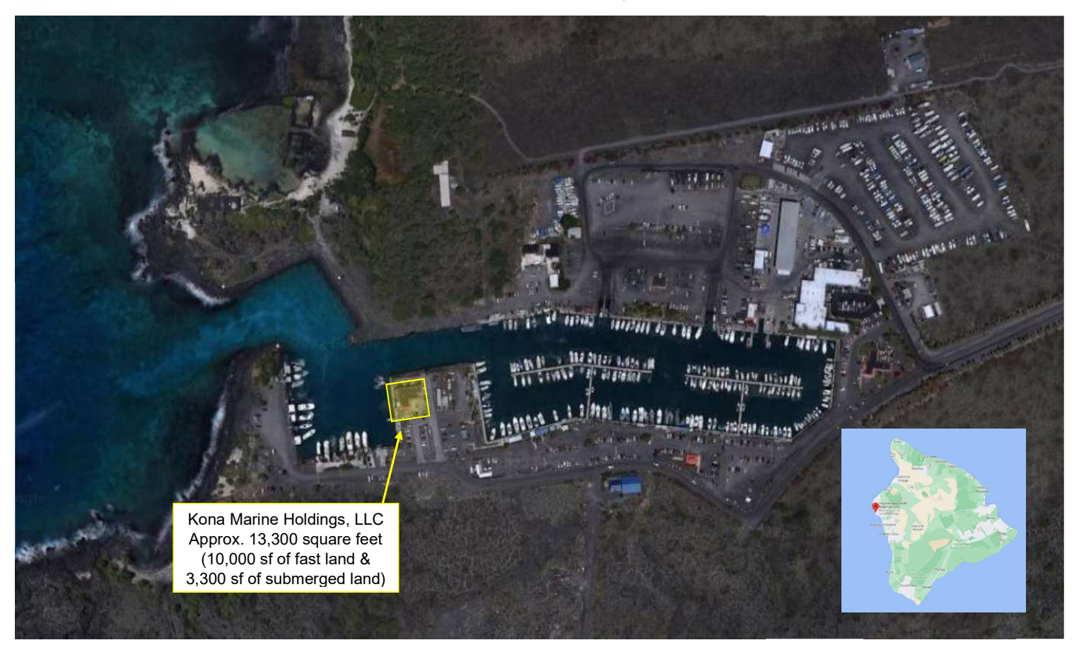
Exhibit A Site Location Honokohau Small Boat Harbor, Hawaii Island