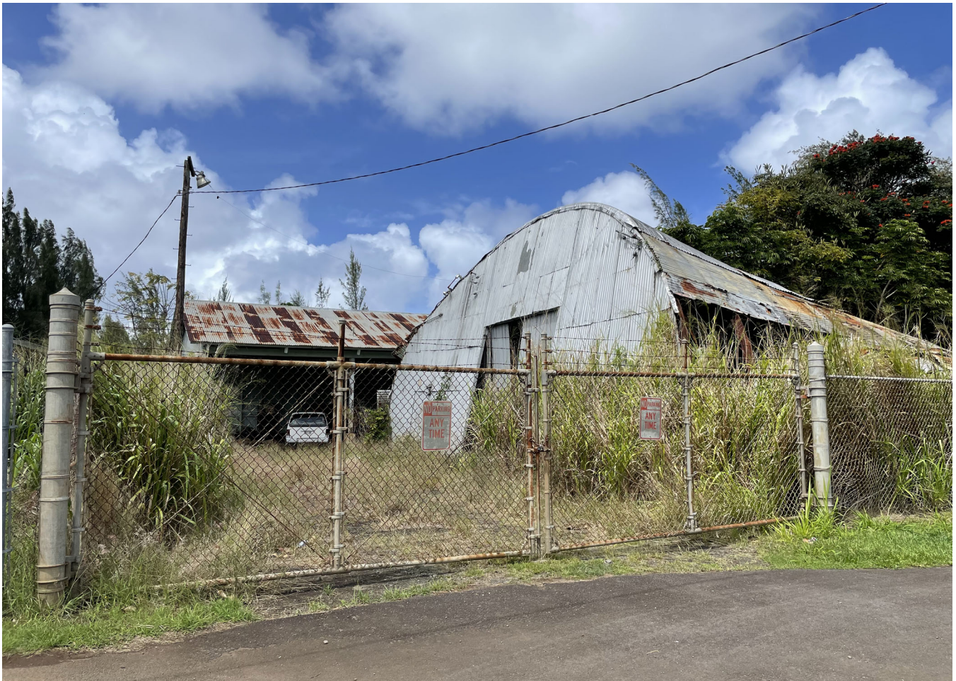
EXHIBIT B - SITE PHOTOS