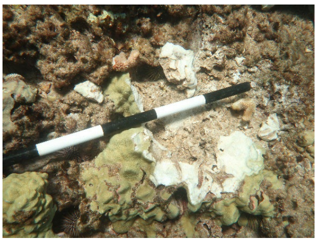
Examples of damage to live rock habitat and corals from the grounding and salvage operations.