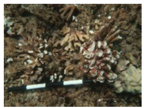
o Figure 5 : Underwater photograph showing coral damage along the grounding salvage scar.