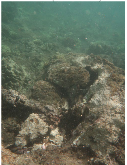
Figure 2 : Photograph showing a section of structured habitat Smashed by the grounding event.

The vessel then remained grounded in extremely shallow water along a basalt boulder shoreline for 14 days while salvage efforts were planned and the pollutants were removed. This area where the vessel remained stranded was composed of flat carbonate pavement and basalt boulder habitat in a high wave energy environment. In this area, a total of 1,575 square meters of live rock habitat was scarred, smashed and/or disturbed (45m long by 35 m wide) (Figure 3). There