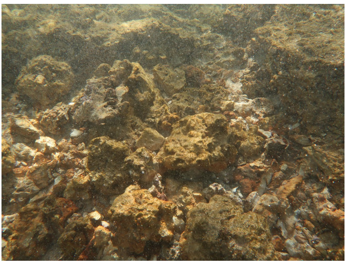
Figure 3 : Underwater photograph showing the damage to hard bottom substrate at the location where the Nakoa was grounded for 6 days.

The final salvage removal operation that was conducted on Sunday, March 5, 2023, resulted in a scar to the substrate that extended an additional 75 meters in a westerly direction from where the vessel was stranded. The initial 15 meters of this salvage scar consisted of two deep trench-like scars that were about 5 meters apart and were each 1 meter wide (Figures 4 & 5). This was followed by a smaller impacted area for the next 60 meters that was limited to about 2 meters of width and extended out to a final depth of 10 feet. Within the deeper habitat, the damage was patchy and mostly composed of damage to individual coral colonies. The combined hard bottom live rock substrate impacted by this salvage scar was 195 square meters. There were significant impacts to living coral colonies all along this total salvage scar area, but the most significant impact to the live rock habitat was along the two scars that each extended 15 m x 1 m (30 square meters). Coral colonies impacted included 77 colonies of Pocillopora meandrina ("cauliflower coral") and 24 colonies of Porites lobata ("lobe coral") for a total of 101 impacted coral colonies within the salvage scar.