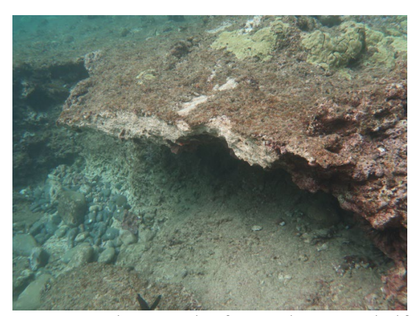
Figure 1 : Photograph of an underwater shelf habitat broken off from impacts during the grounding of the vessel "Nakoa".

The initial grounding incident resulted in a patchy impact scar extending 85 meters by 2 meters from a northwestern direction (170 square meters). Of this total 170 square meters of disturbed habitat, 35.5 square meters of clearly damaged high rugosity live rock habitat was specifically documented and photographed (Figures 1 & 2). In addition, there were 18 coral colonies directly damaged or destroyed during this grounding. All damaged coral colonies were individually documented during the initial grounding inspection and consisted of 8 colonies of Pocillopora meandrina ("cauliflower coral") and 10 colonies of Porites lobata ("lobe coral").