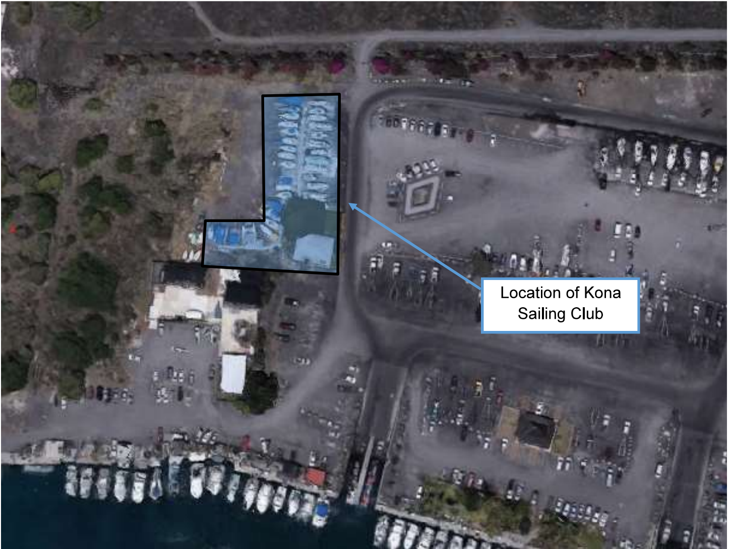
Exhibit A Kona Sailing Club Honokohau Small Boat Harbor