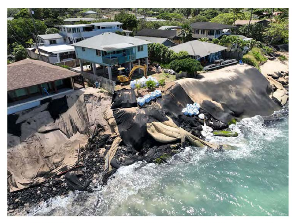
<u>9/7/202</u>2 OCCL-Photo of Mr. Youman and his Agent Installing Unauthorized Sandbags in the Expired and Unauthorized Erosion Control Structure in the Shoreline Area Fronting the Subject Parcel

This OCCL photo from <u>September 7, 2022</u> shows the shocking and clearly intentional extent and nature of the overall "installation" of the materials piled into the public shoreline by Zhungo/Youman: