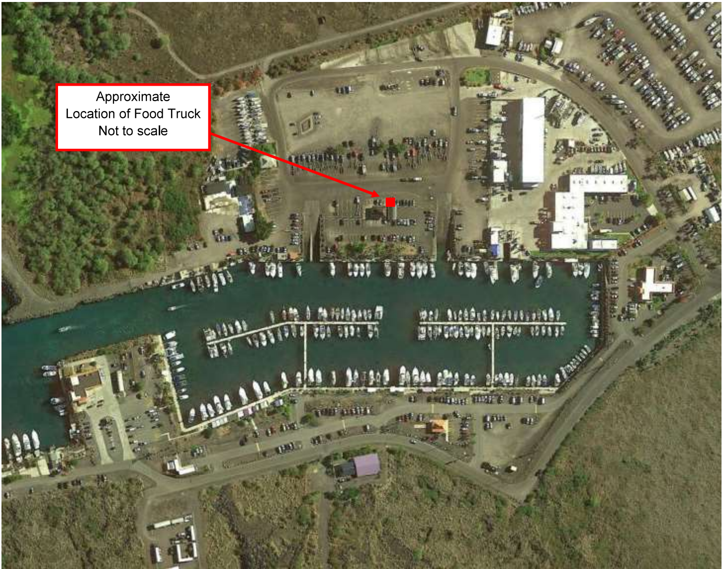
Exhibit A-1 Location of Da So Fresh Express LLC Honokohau Small Boat Harbor

Approximate Location of Food Truck Not to scale