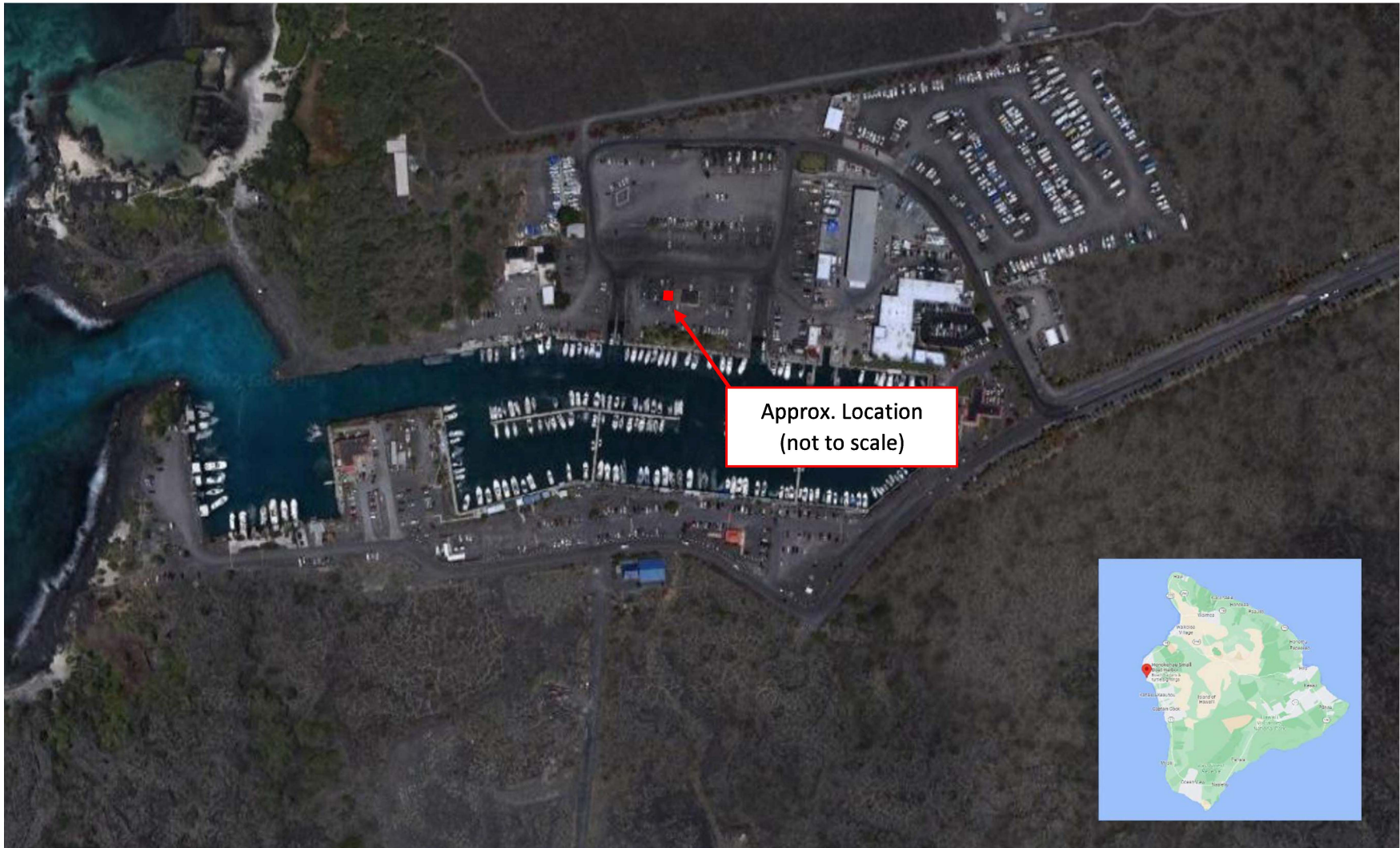
Exhibit A Location of Riddle Works LLC Ice Machine Honokohau Small Boat Harbor, Hawaii Island