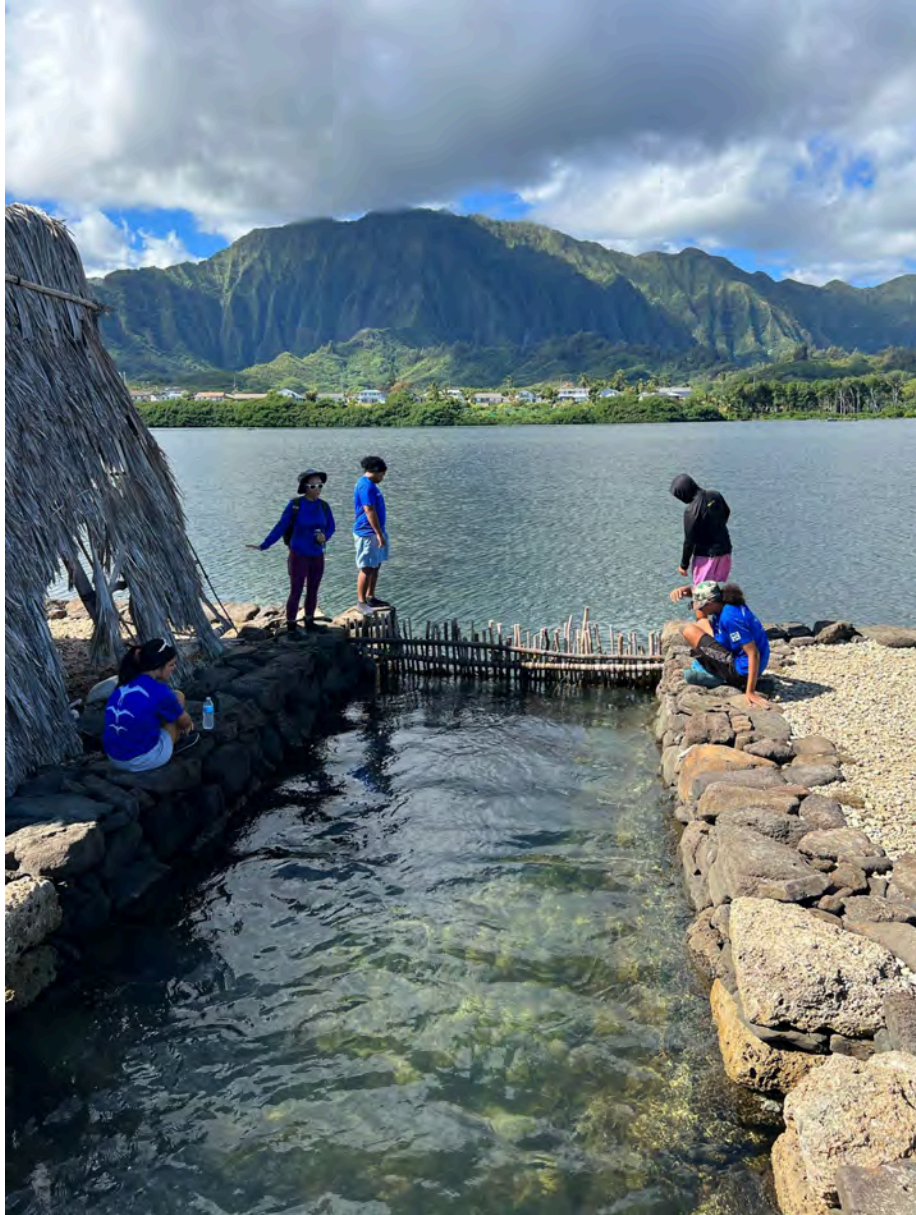
This picture was taken

at Paepae o he'eia, our first day was barely any hana but more of a tour around the pond. The tour of the pond connects to malama aina because the more we know more about our fishponds, the more we can identify the problems within them, and the more we can identify the problems within them, the more our people can come together to help think of solutions. We learned a lot of moolelo that came along with our tour, one of the beings that watches over Paepae whose favorite color is yellow, and how we know that she's present at Paepae is the biggest Makaha at Paepae has little yellow fishes on the outside. There's another moolelo about Paepae that has this manta ray that would swim over to the fishpond whenever there were thieves trying to take fishes from the Makaha, and would wrap the tail around the thieves neck and would swim everywhere in the ocean, dragging the thief, and when the manta ray was done with the thief, it would drop it off by the other makaha that has this shark that would finish the thief off and eat them.