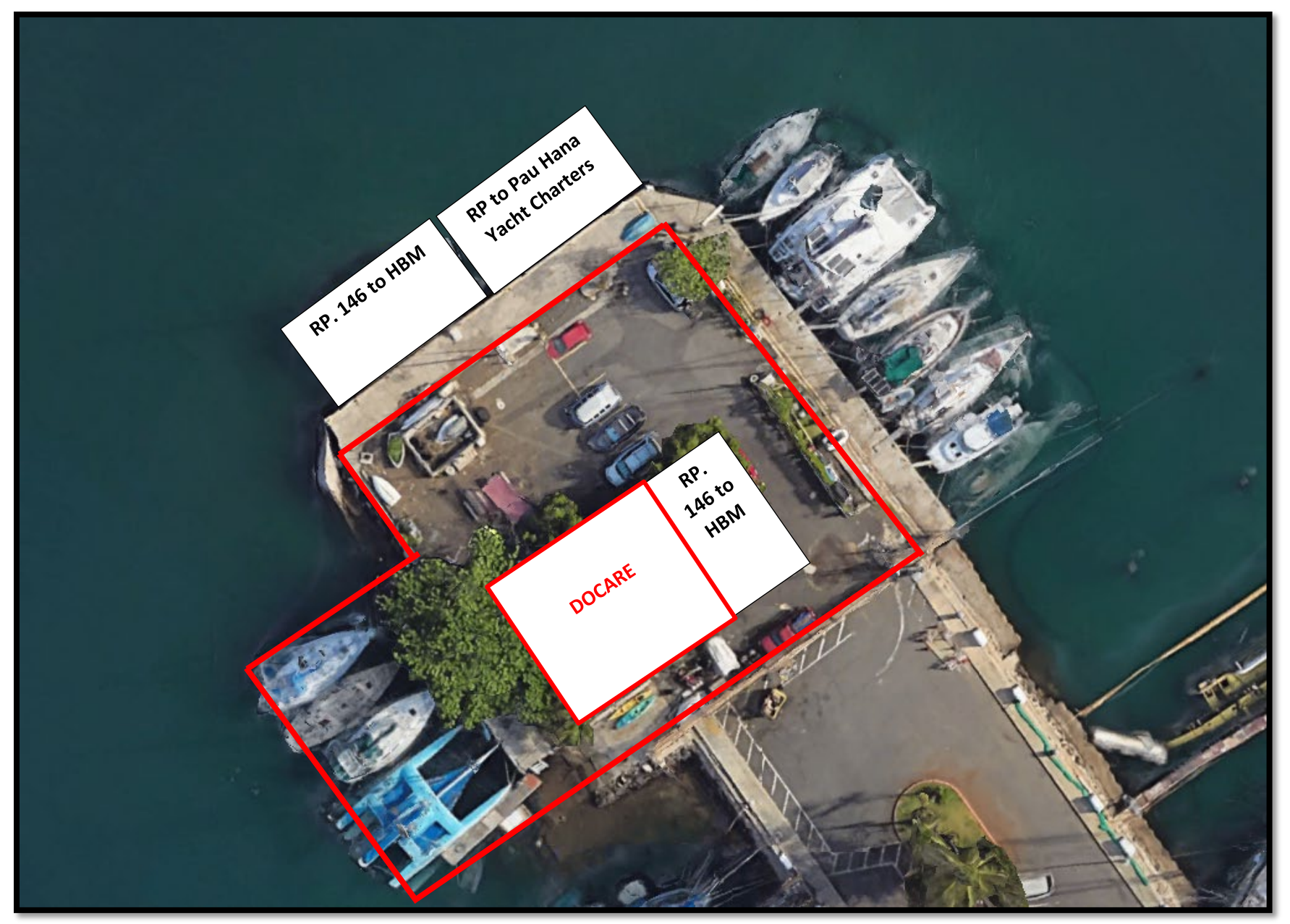
Ala Wai SBH Fuel Dock – Division of Space on Fuel Dock