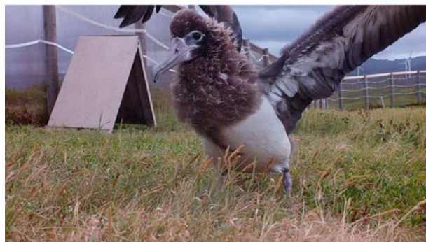
Ho'okipa's Chick raised by foster parents at James Campbell Wildlife Refuge June 17, 2024

In closing, we wish to share some good news. The egg that Ho'okipa and her partner were incubating when she was killed was rescued by USFWS and HMAR and given to adoptive Laysan Albatross parents at James Campbell National Wildlife Refuge. In February, a healthy chick hatched and has been thriving. Ho'okipa's offspring will soon fledge along with four chicks from Marconi/Turtle Bay, joining their 'ohana at sea. We look forward to seeing them when they return home in a few years to this beautiful coastline that you helped to save.