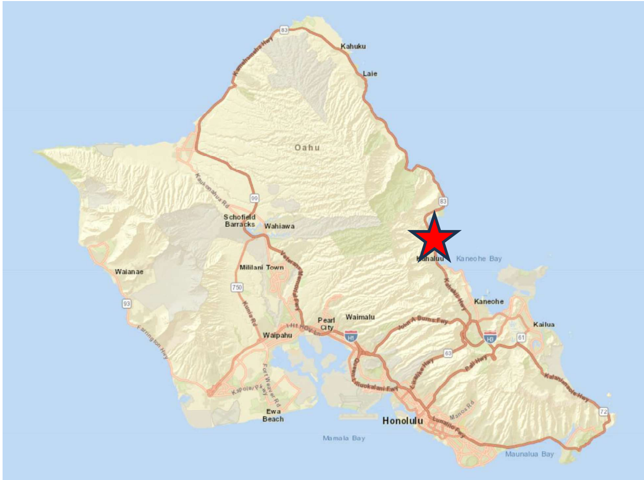
Waiahole Project Area