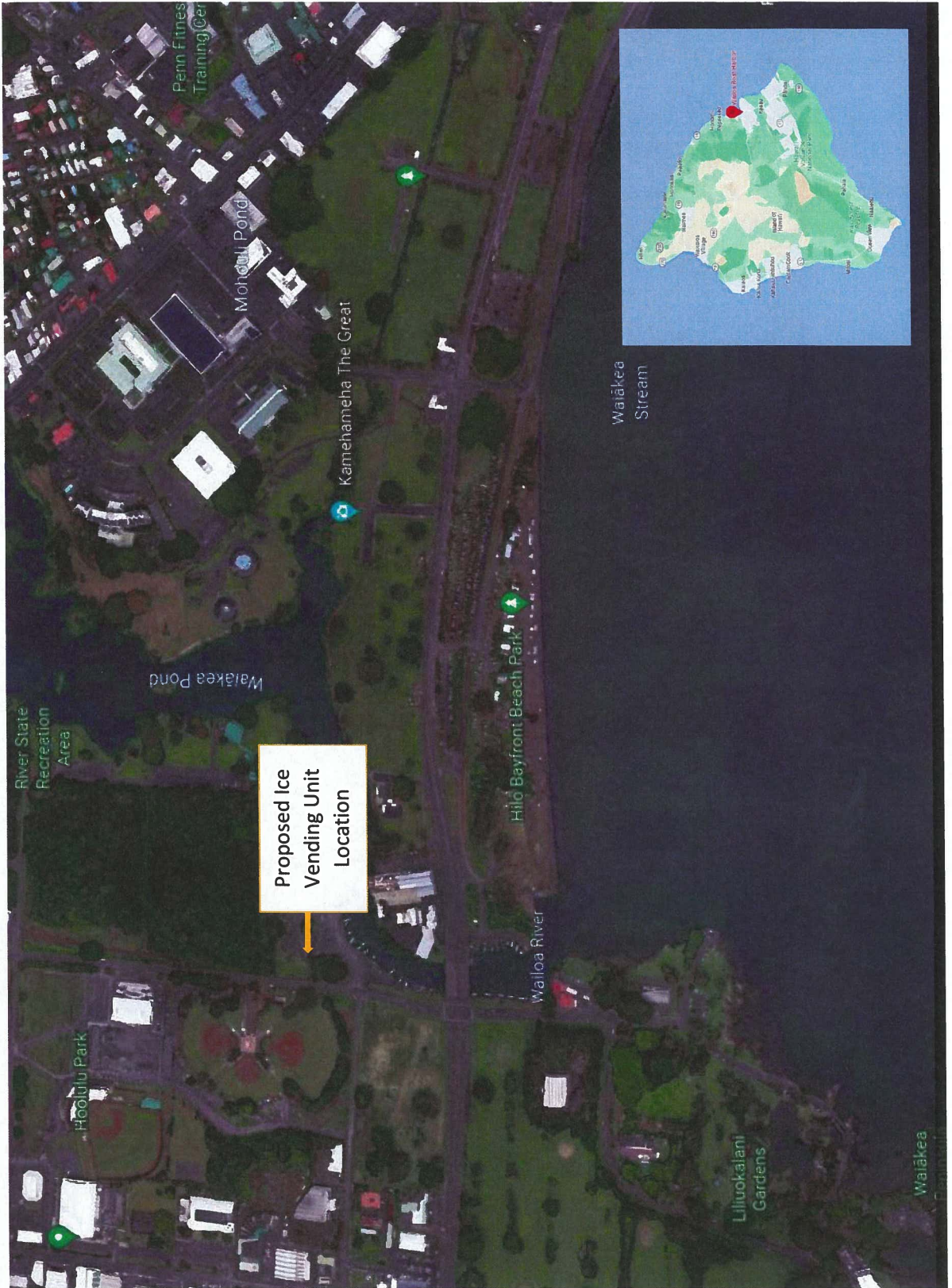
Exhibit A-1 Wailoa Small Boat Harbor