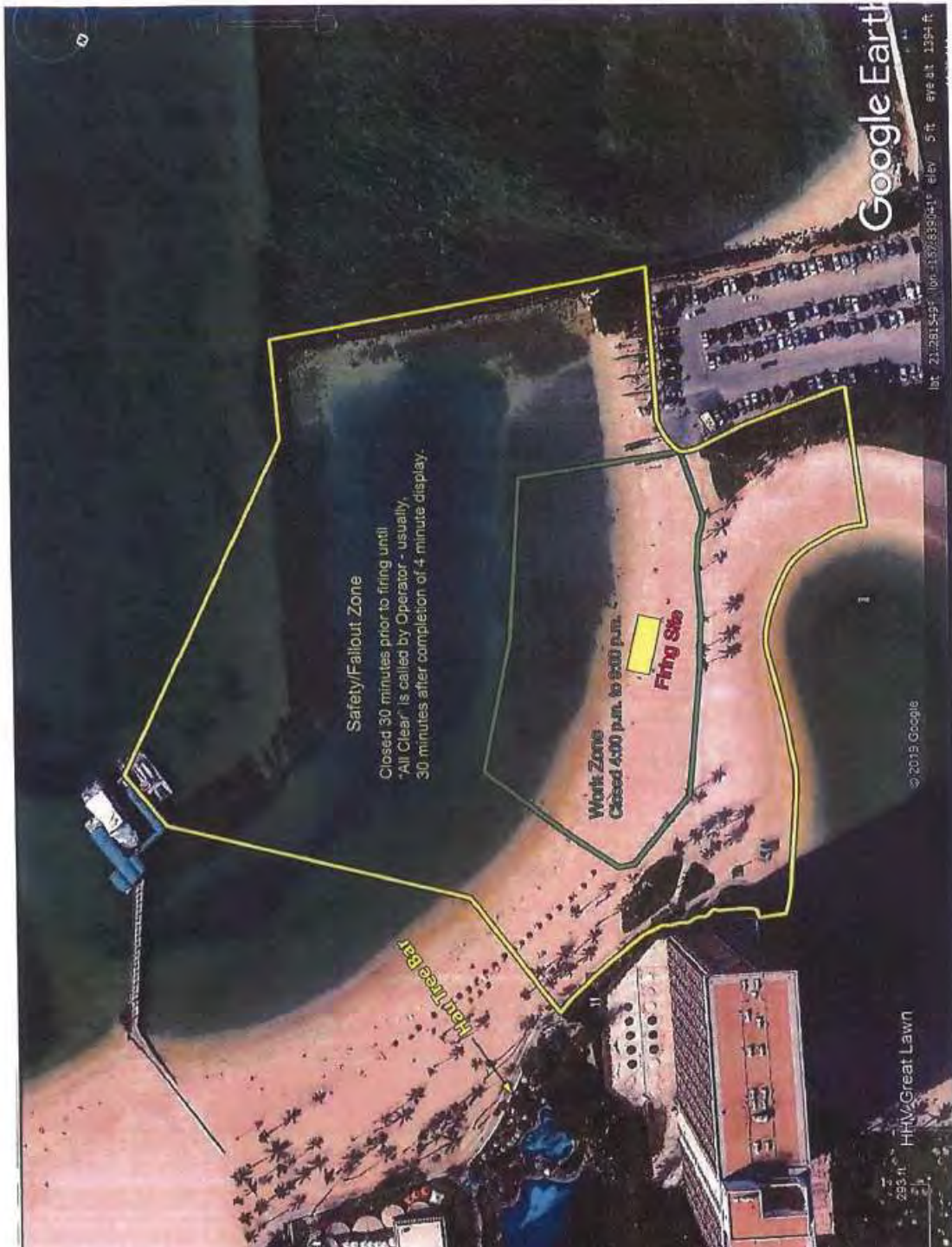
EXHIBIT FROM RIGHT-OF-ENTRY NO. 4607 ISSUED TO HAWAII EXPLOSIVES & PYROTECNICS, INC