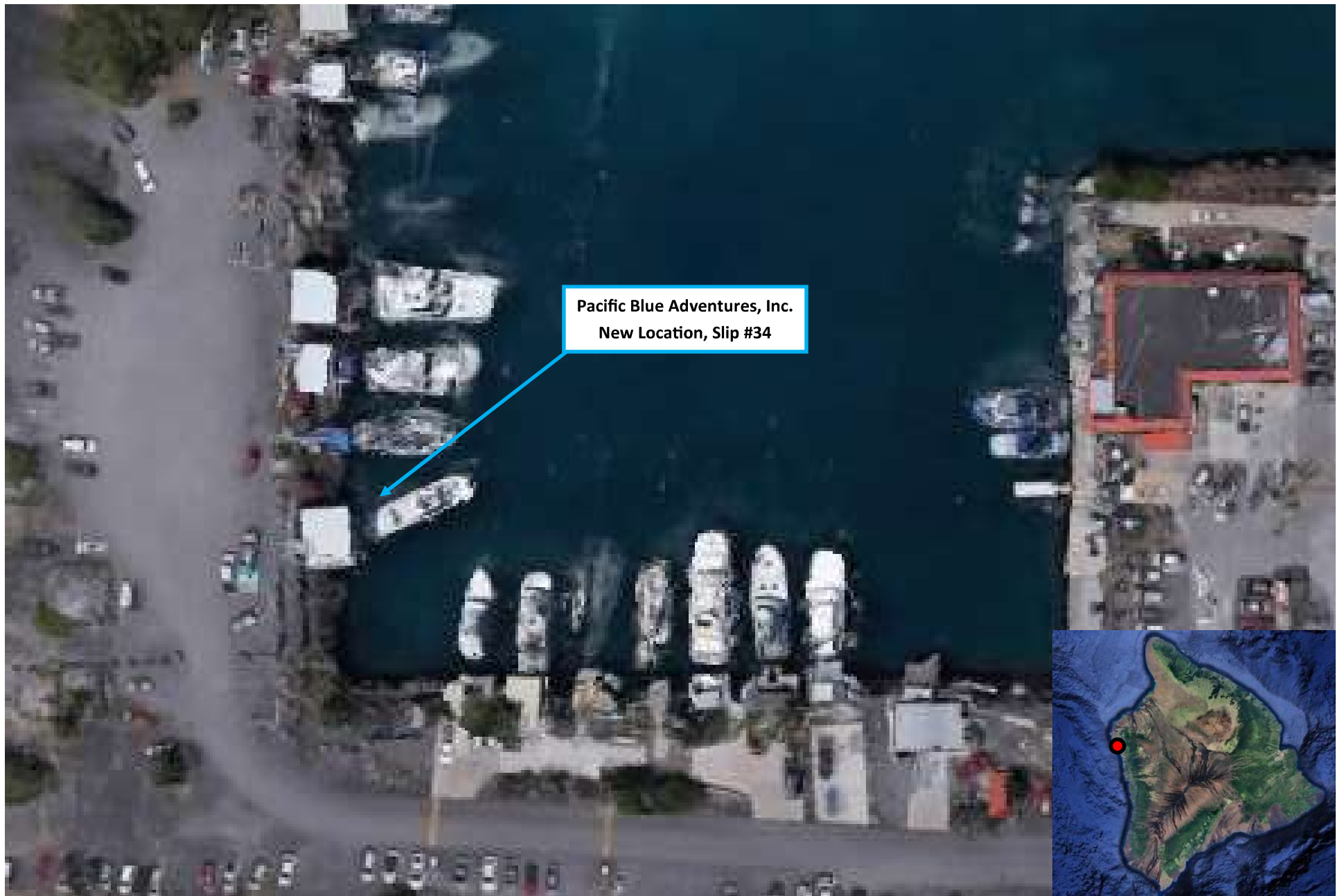
Exhibit A-1 Honokohau Small Boat Harbor - Site Location