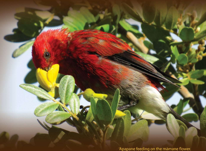
'Apapane feeding on the māmane flower.