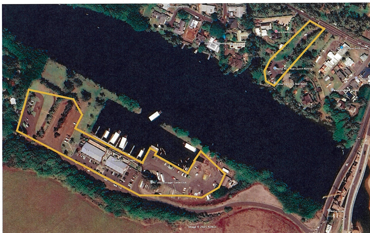
Wailua Marina and Kaumualii