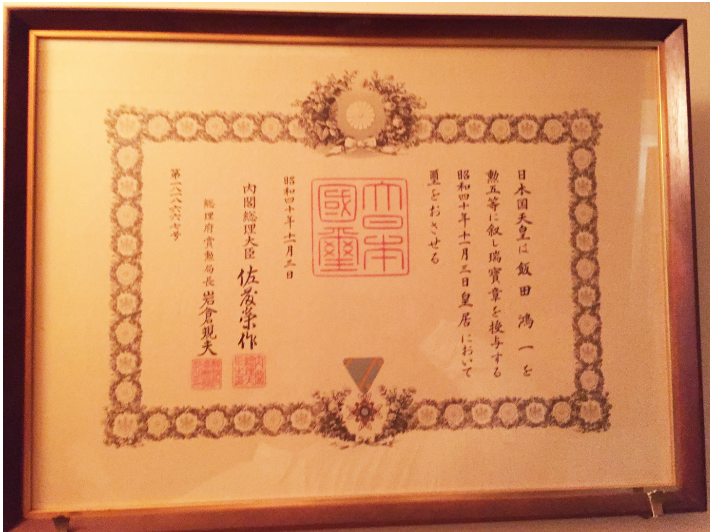
Figure 9: Photograph of certificate issued to Koichi Iida, from Hirohito - Emperor of Japan. The document is the Order of the Sacred Treasure, Gold and Silver Rays in 1965. The award was given due to Koichi Iida's many contributions to the Japanese community on the Islands