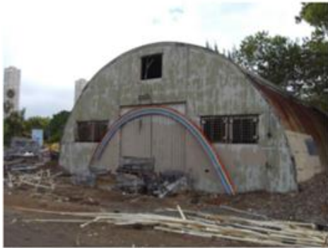
View from southeast