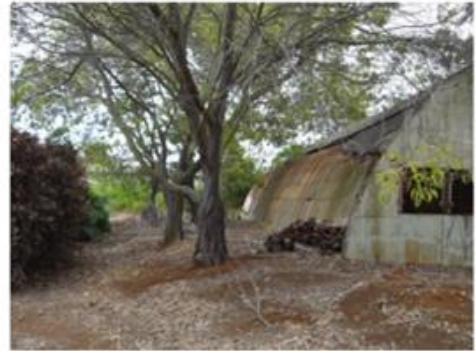
View from northeast