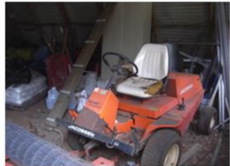
View of stored equipment