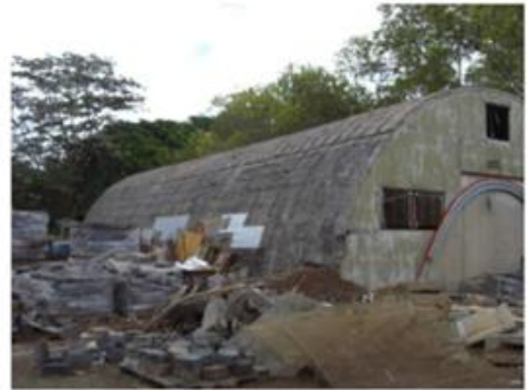
View from southwest