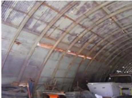
View of interior walls