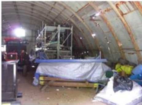
View of interior walls