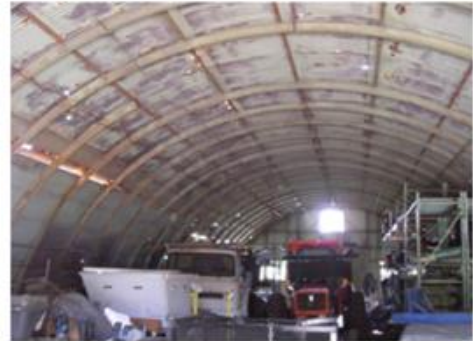
View of interior ceiling