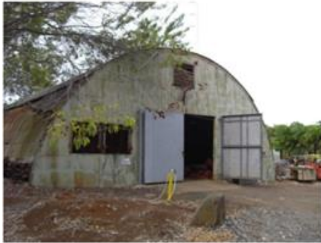
View from northeast