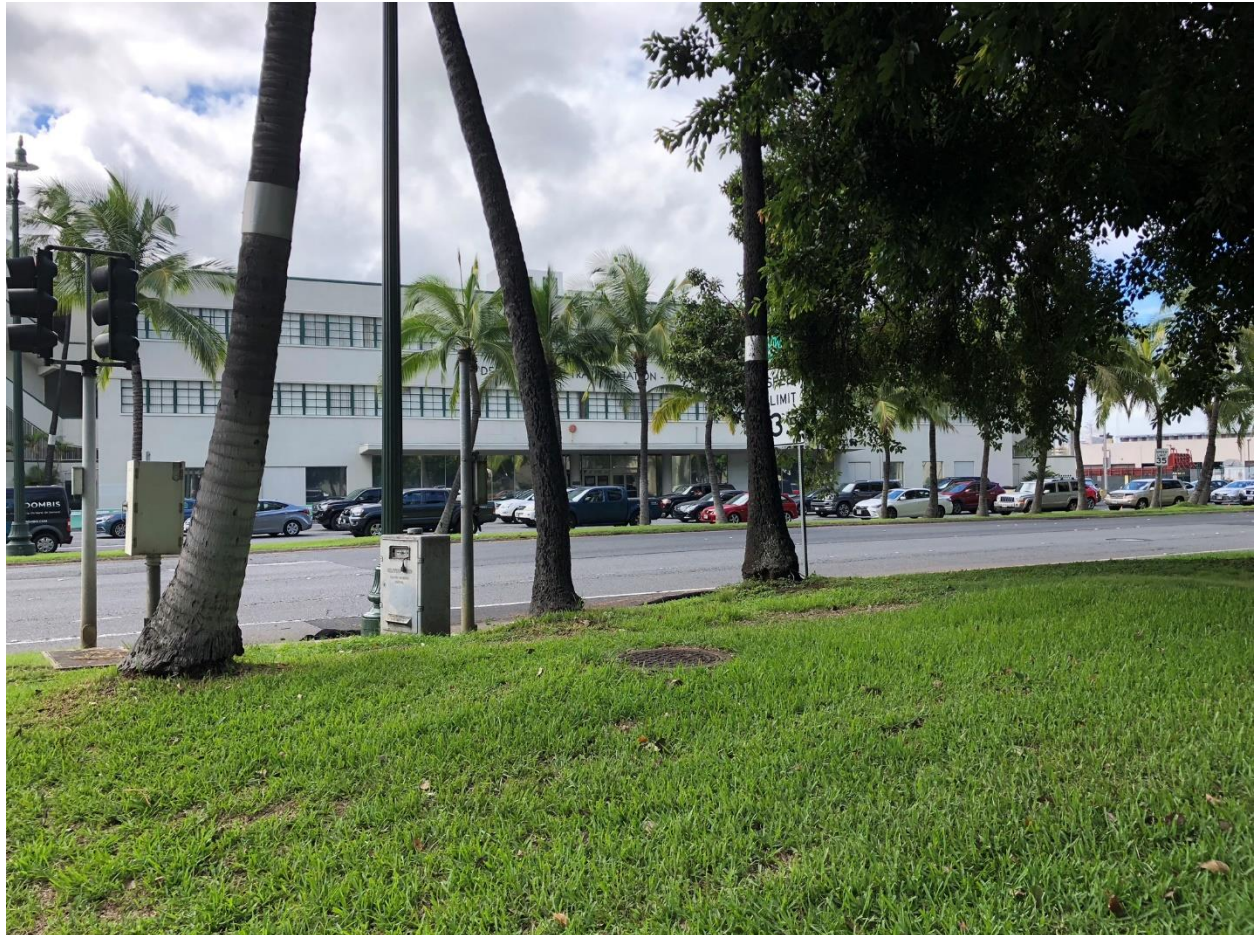
Photo 4 of 7. View of the DOT Harbors Division building from Walker Park. Camera facing west.