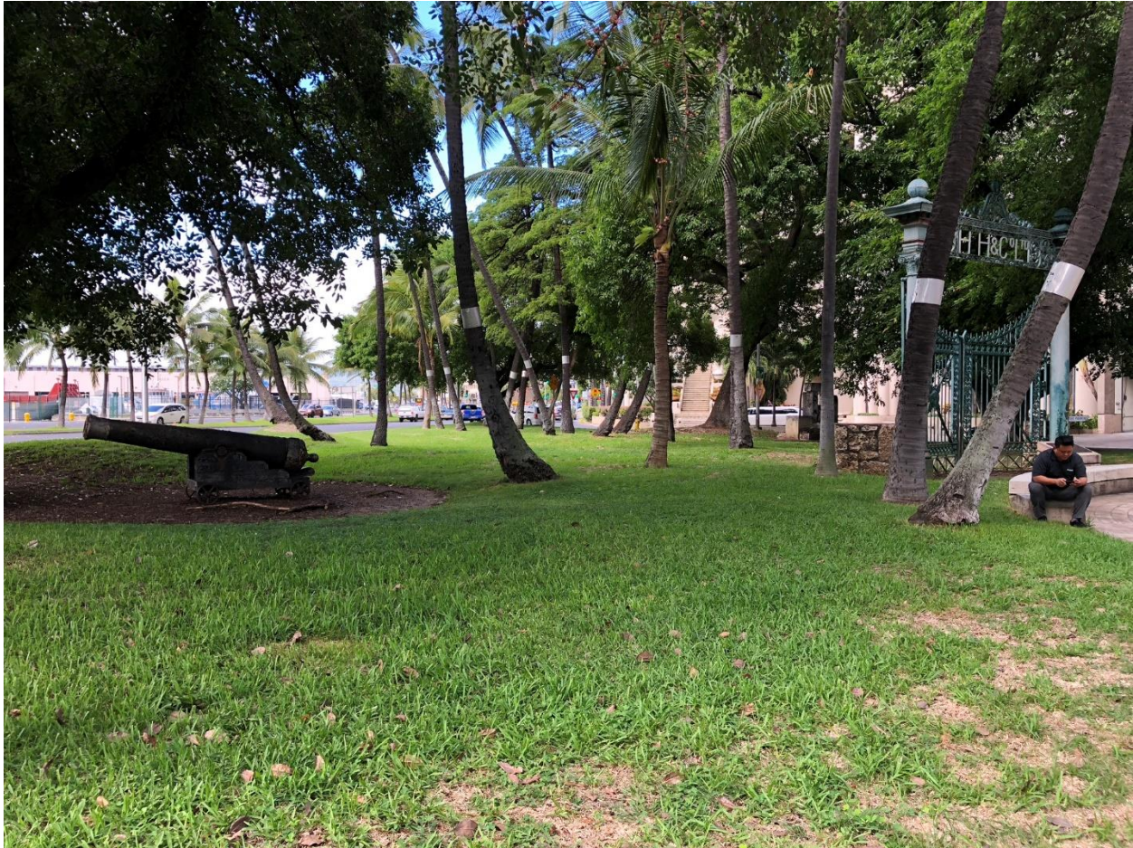
Photo 2 of 7. Walker Park showing old and newer growth tree cover, historic cannon, H. Hackfeld & Co. gate, and coral blocks from the Old Courthouse. Camera facing north-northeast.