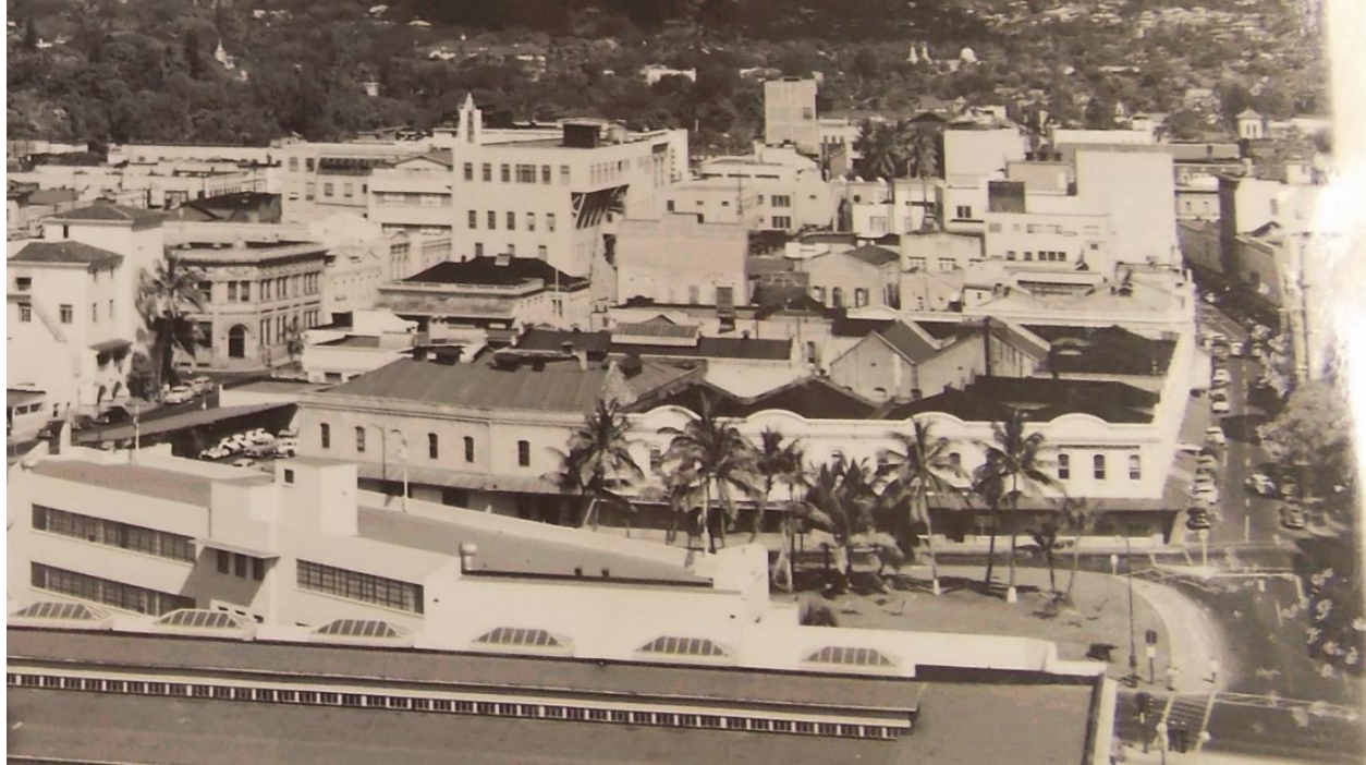
Figure 6: View of Walker Park from Aloha Tower in 1953. Camera facing east-north east