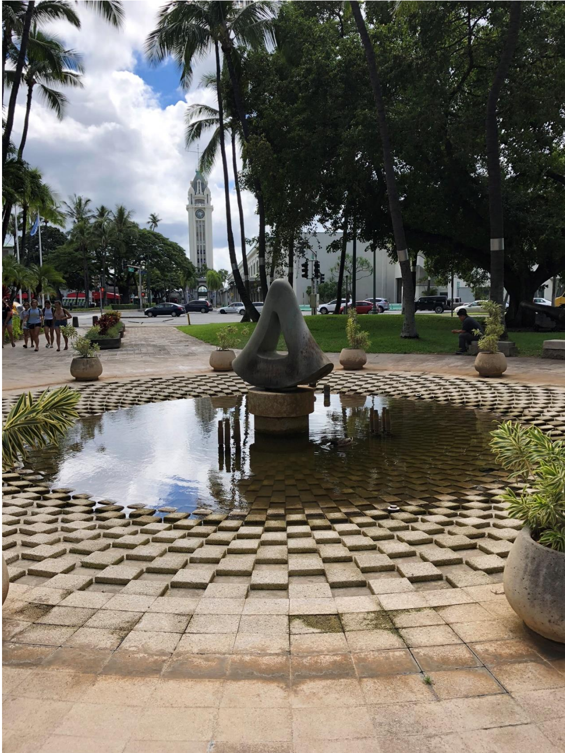
Photo 5 of 7. Pedestrian walkway and fountain with ca. 1992 sculpture added to Walker Park by AMFAC. View of Aloha Tower and the Pier 10 and 11 terminal building in the distance. Camera facing west-southwest.