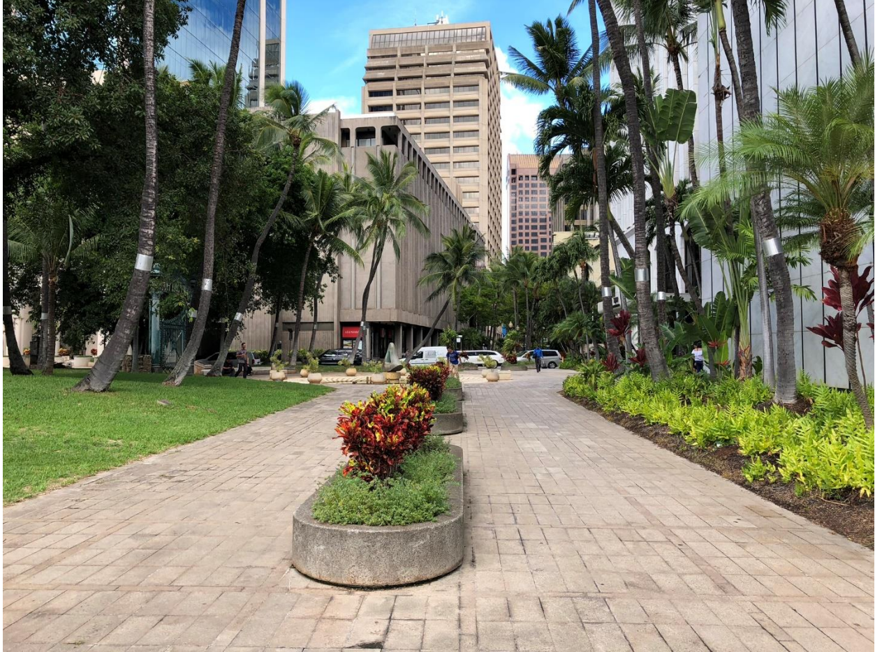
Photo 6 of 7. Pedestrian walkway with the historic Fort Street corridor in the distance. Camera facing east-northeast.