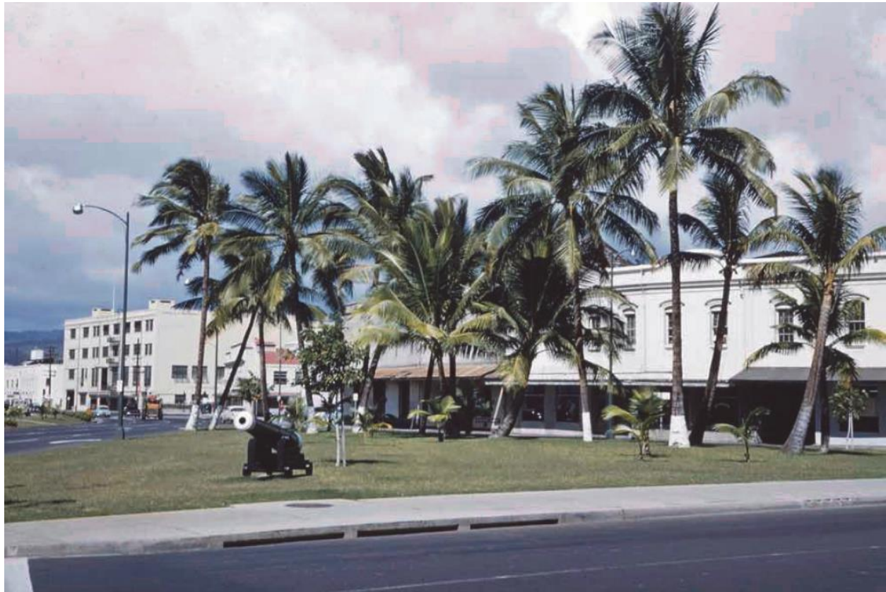
Figure 5: View of Walker Park facing north from the H. Hackfeld & Co. Building, 1952. Camera facing north-north east