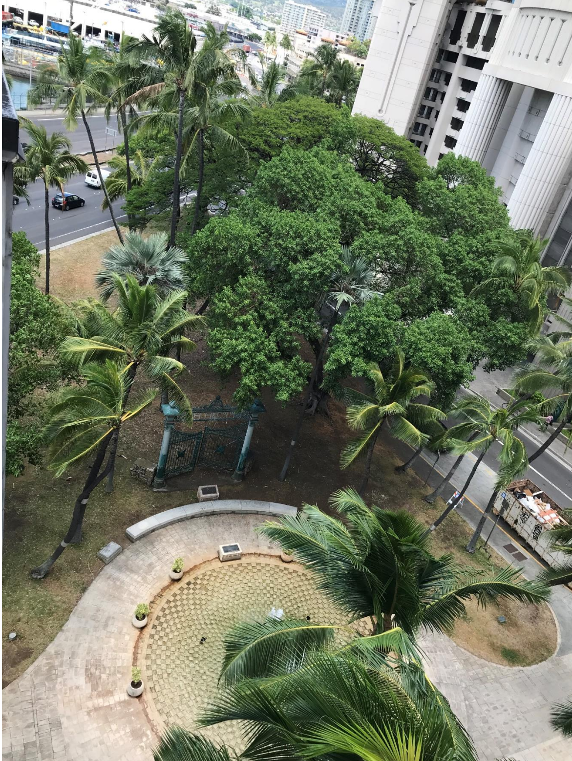
Photo 1 of 7. Walker Park from Topa Tower. Camera facing northwest.