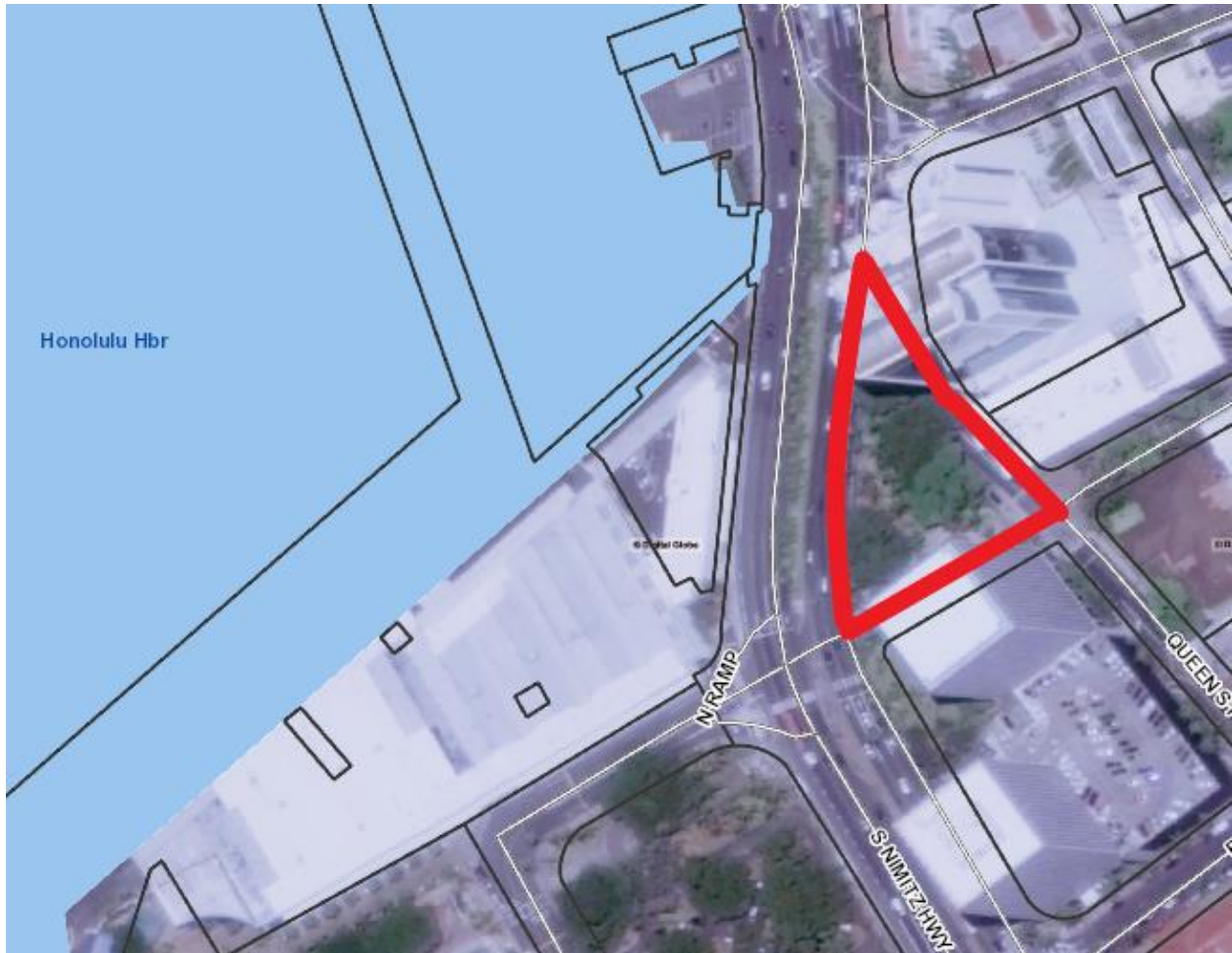
Figure 2: GIS Map showing boundary of Walker Park Boundary added