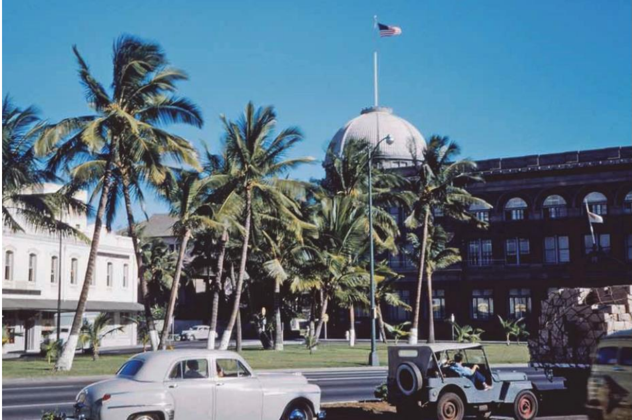
Figure 4: View of Walker Park from Nimitz Highway facing Fort Street, 1952.