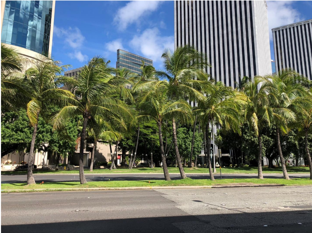
Photo 7 of 7. View of Walker Park from the DOT Harbors Division building. Camera facing east.

Paperwork Reduction Act Statement: This information is being collected for applications to the National Register of Historic Places to nominate properties for listing or determine eligibility for listing, to list properties, and to amend existing listings. Response to this request is required to obtain a benefit in accordance with the National Historic Preservation Act, as amended (16 U.S.C.460 et seq.).