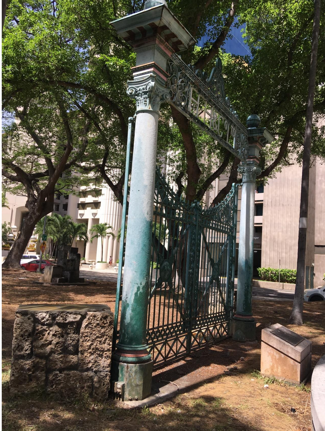
Photo 3 of 7. H. Hackfeld & Co. gate. Note coral block and plaque. Basalt Sculpture in background. Camera facing north.